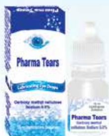
Pharma Tears Artificial Tears