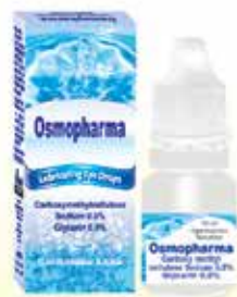
Osmopharma Artificial Tears