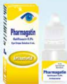
Pharmagatin 4 th Generation Quinolone