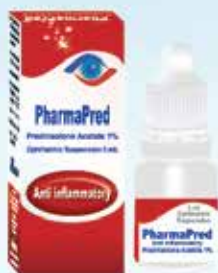
Pharma Pred Corticosteroid